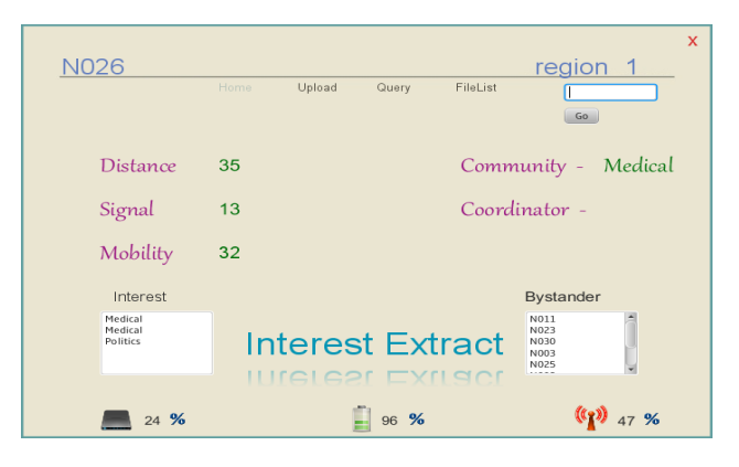
Figure 2: Interest Extraction

Here, Nodes that contain related type of keywords based on a particular field are characterized as a community. Consider a node which has the highest probable category as its community that one file belong to different category. Here, allocate the coordinator and ambassador role to a node based on its mobility. This can change as a result based on the available nodes at there.